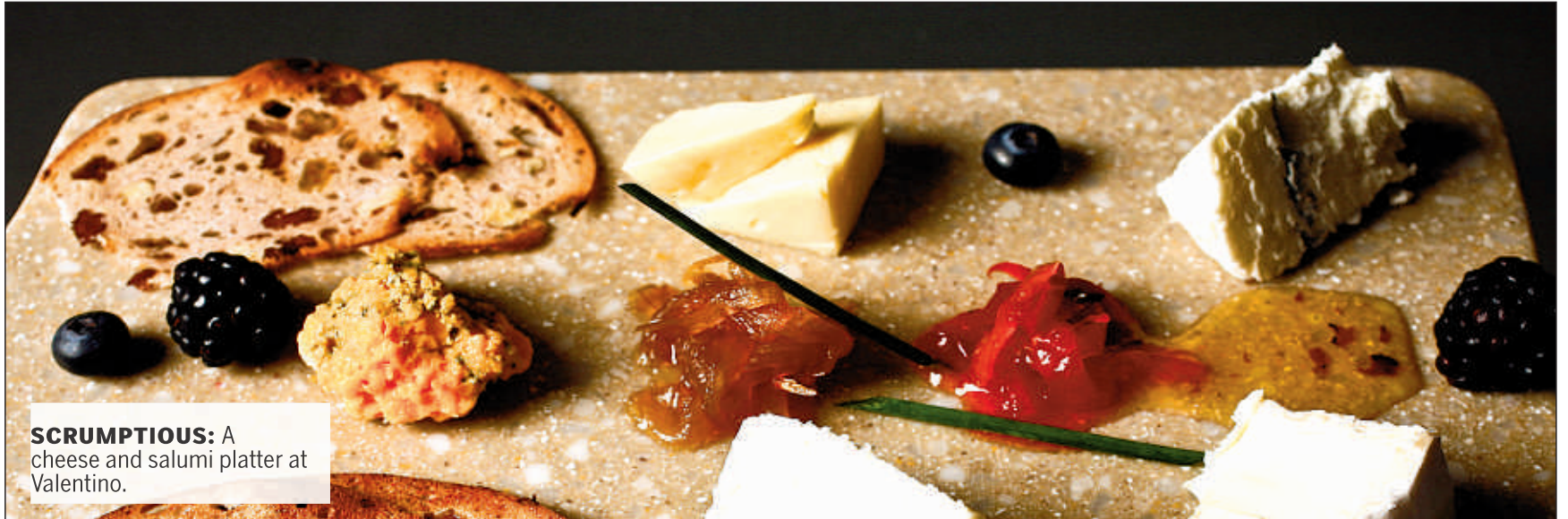
SCRUMPTIOUS: A cheese and salumi platter at Valentino.