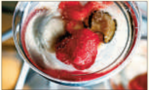
DRINK UP: This Oyster Tree is on the menu at Valentino.

2525A West Loop South in Hotel Derek, 713-850-9200, www.ValentinoRestaurantGroup.com.